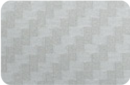
090 silver grey